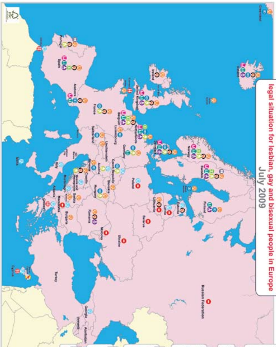
Rainbow Europe: legal situation for lesbian, gay and bisexual people in Europe July 2009